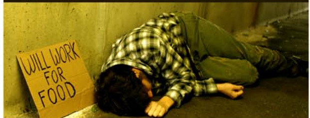
Give to the one who asks you, and do not turn away from the one who wants to borrow from you. Matt 5:42